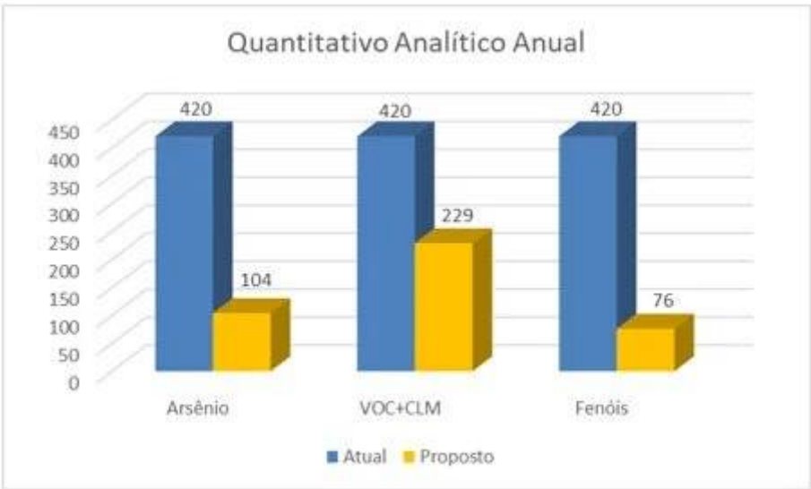
Gráfico 2 – Comparativo entre escopo analítico atual X proposto